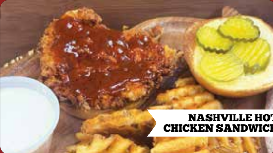
NASHVILLE HOT CHICKEN SANDWICH