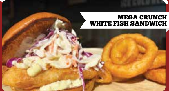
MEGA CRUNCH WHITE FISH SANDWICH