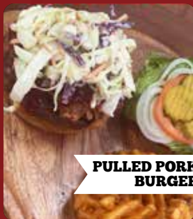
PULLED PORK BURGER

CONSUMING RAW OR UNDERCOOKED MEATS, POULTRY, SEAFOOD, SHELLFISH OR EGGS MAY INCREASE YOUR RISK OF FOODBORNE ILLNESS, ESPECIALLY IF YOU HAVE A MEDICAL CONDITION