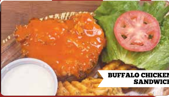
BUFFALO CHICKEN SANDWICH