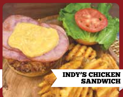
INDY'S CHICKEN SANDWICH

SUBSTITUTIONS AND MODIFICATIONS ARE SUBJECT TO UPCHARGE