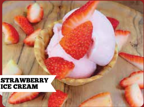
STRAWBERRY ICE CREAM