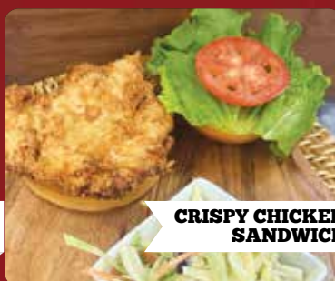
CRISPY CHICKEN SANDWICH