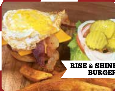
RISE & SHINE BURGER