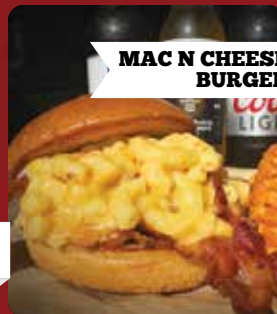
MAC N CHEESE BURGER

SUBSTITUTIONS AND MODIFICATIONS ARE SUBJECT TO UPCHARGE